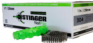
Stainless Steel Nails