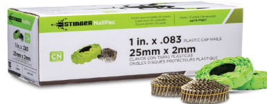
Low Carbon Steel Nails